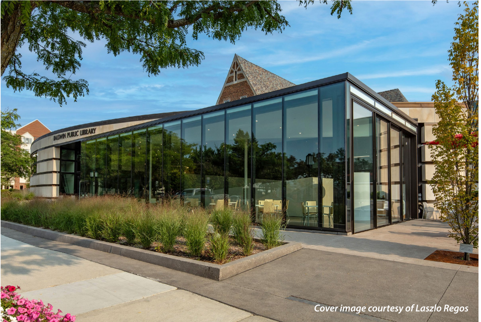
Cover image courtesy of Laszlo Regos